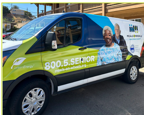
Our brand new electric vans donated by Citizens Energy

We extend our thanks to Citizen's Energy Corporation for their generous donation of six electric vans to Meals on Wheels San Diego County. Their commitment to sustainable transportation enhances our mission of delivering meals and support to seniors in the most efficient and environmentally friendly way.