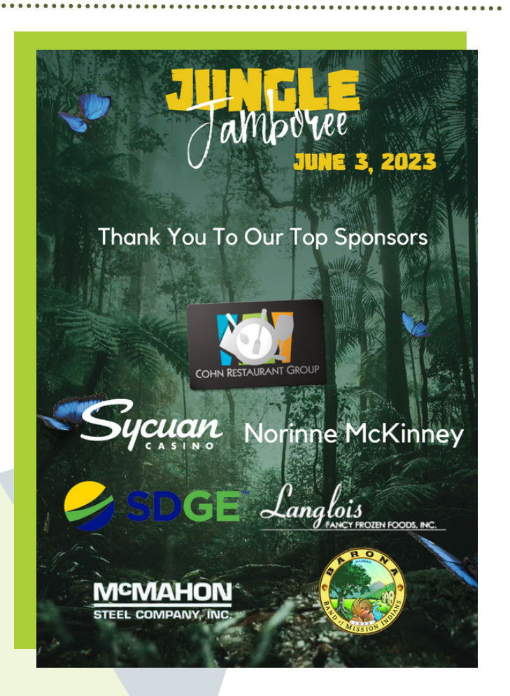
WE ARE SO EXCITED TO CELEBRATE AT OUR JUNGLE JAMBOREE ON JUNE 3RD. IF YOU WANT TO BE A PART OF THE FUN, VISIT: MEALS-ON-WHEELS.ORG/EVENT/