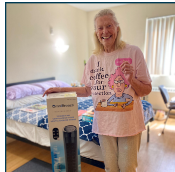
Happy client with her new fan!

Thanks to everyone who participated in our June fan drive! We called on San Diegans to donate fans and funds to help us keep our seniors cool during the hot summer months. Together, we delivered more than 250 fans! Thank you for caring about our seniors!