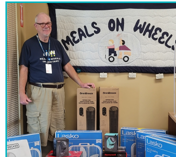
Volunteer with donated fans.