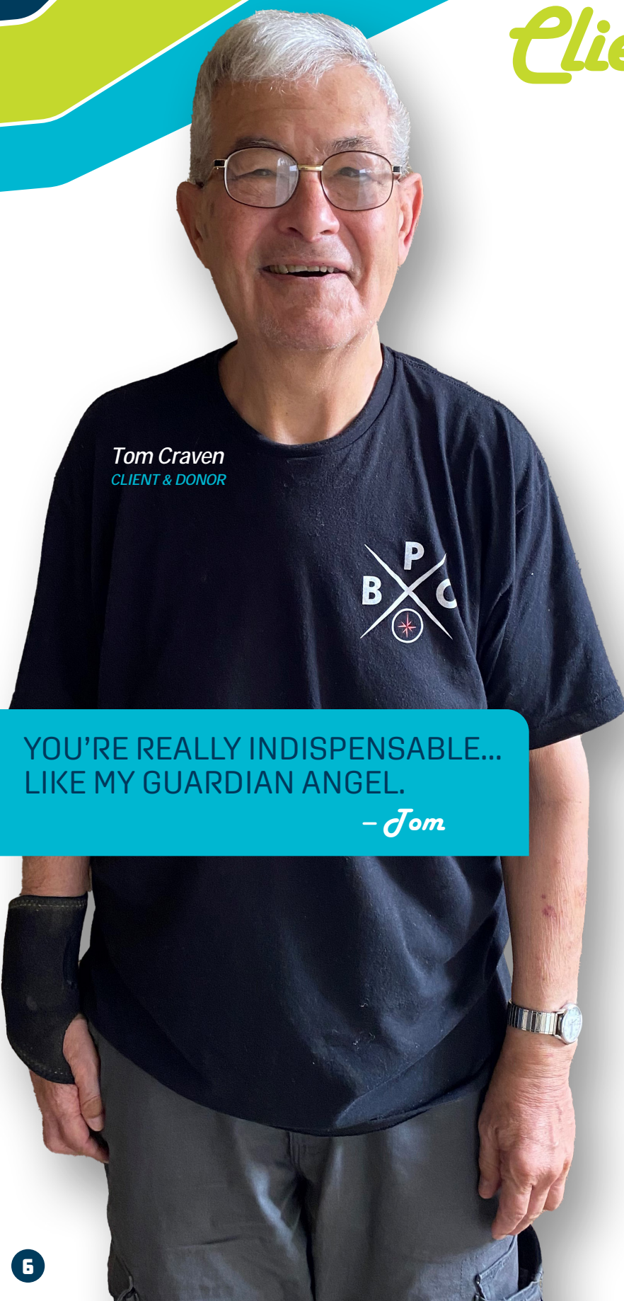
Tom Craven CLIENT & DONOR